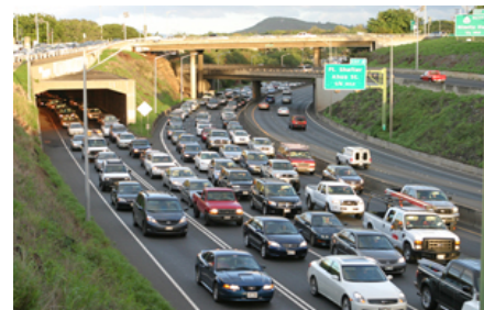
Restriping will add an additional lane in both directions to improve traffic flow, including at the Middle Street merge.

We acknowledge the inconvenience that the work creates and urge drivers to avoid this area if possible. More details will be posted at a project website to be launched approaching the start of construction. Please check the DOT GoAkamai.org traveler information site for real-time traffic information.